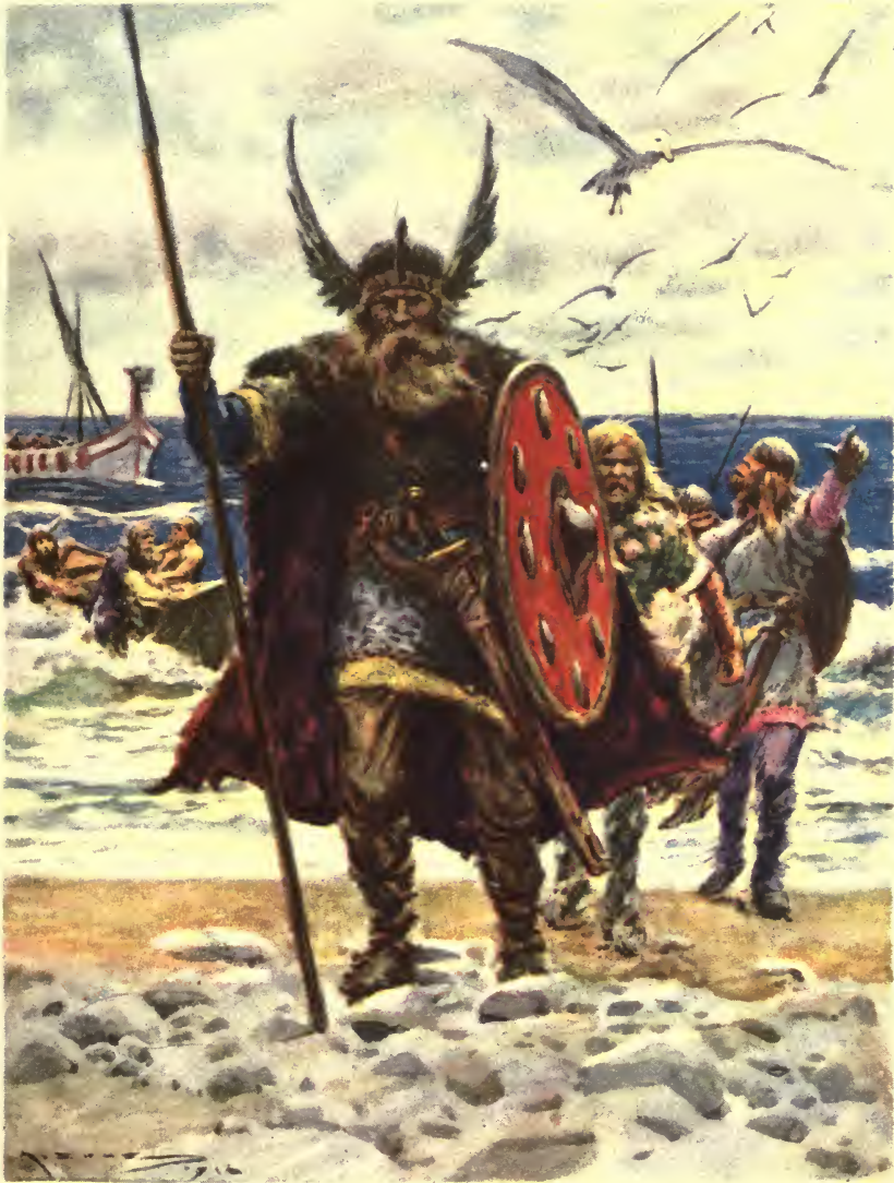
THE LANDING OF THE VIKINGS

It seemed to Leif and his companions that there was no good thing in this land. "I will call it Helluland or Stone Land," said Leif.